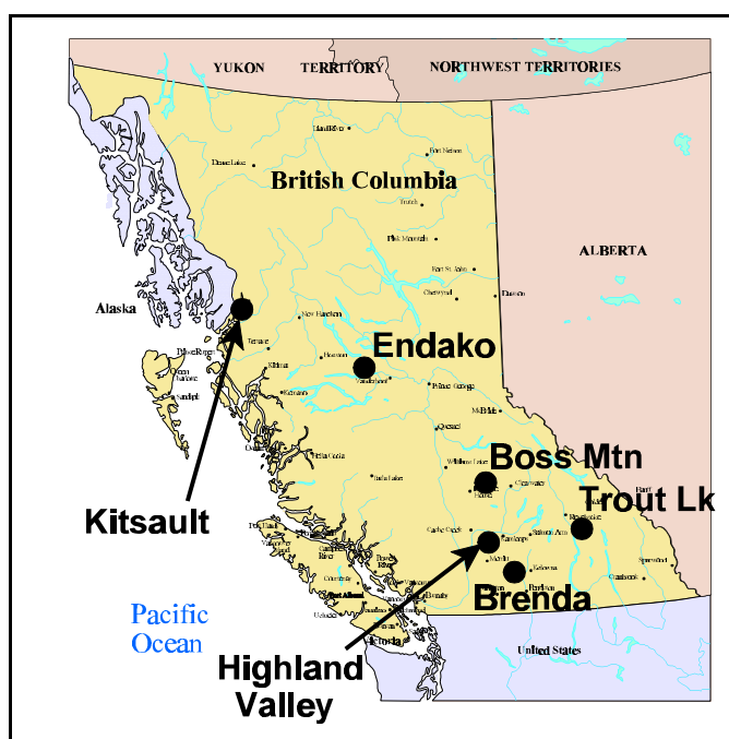
FIGURE 1. Locations of Six Molybdenum-Related Ore Deposits Discussed Here, in British Columbia, Canada.

Due to factors such as temperature, pressure, host-rock geochemistry, and proportions of